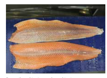
From silver skinning to deep skinning