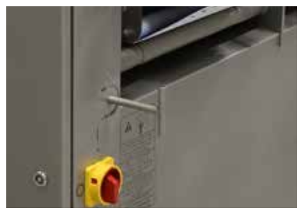
Single T-handle allows for infinite adjustments for proper skinning